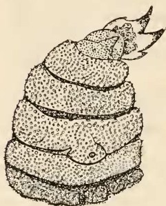
FIG 2.— Peripatus barbouri , sp. nov. Fifth leg of female showing position of nephridial tubercle.

Anatomy. The position of the ovaries has been determined from the largest specimen, which contained embryos. The ovaries lie approximately between the legs of the sixth praeanal pair, and their ligaments are distinctly separate all the way to the base of the ovaries, although they lie very close together. The salivary glands terminate between the third and fourth praeanal pairs of legs.